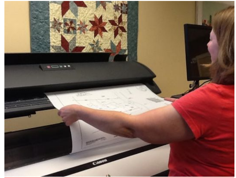
Scanning Mylar into Digital System – Colchester